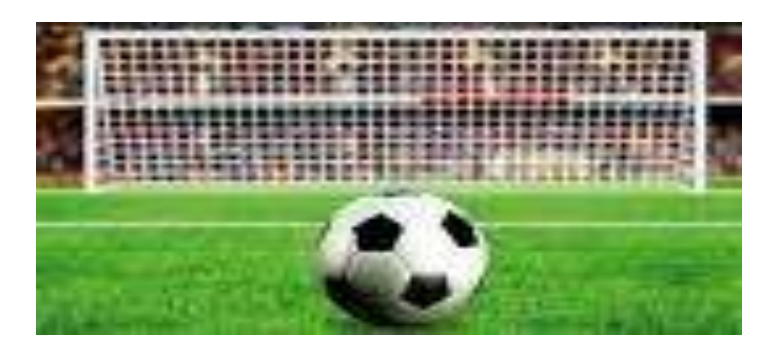
The Semi Finals

Then the big game came. It was either the annoyance of our draw or the happiness of our winning that caused us to play like never before. We were such an amazing team and we won 3:1.